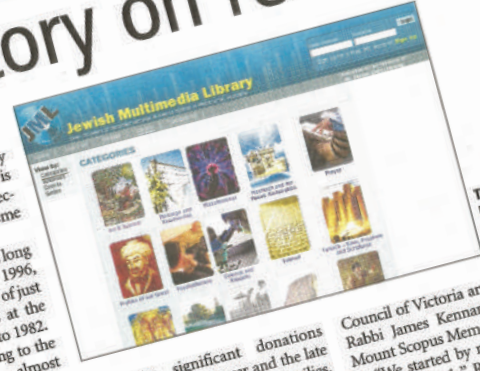
The Jewish Multimedia Library website.